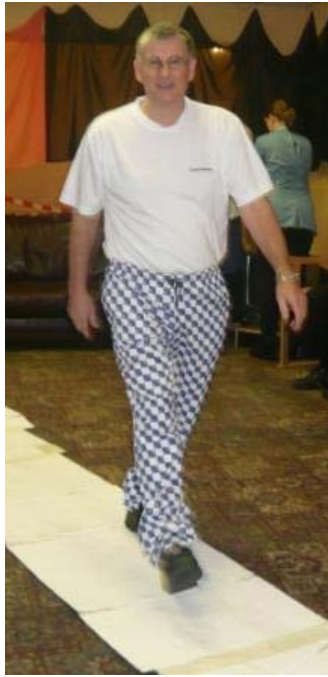
Ouch! Mr Smooth