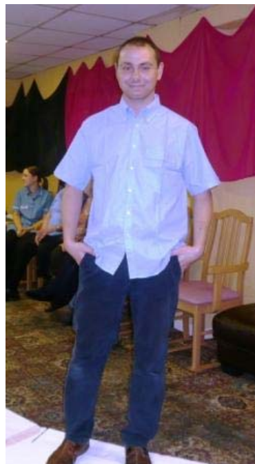
Too cool for school