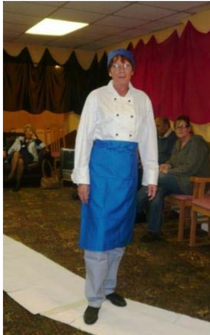
Lady in blue